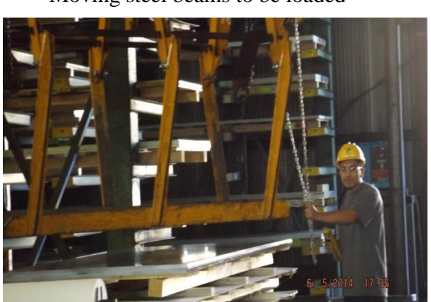
Member moving steel to be loaded