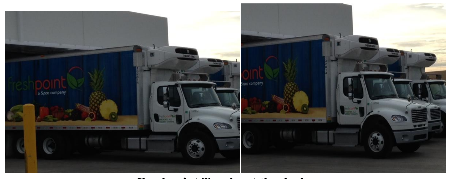
Freshpoint Trucks at the docks. Almost all of these employees became New Members. Welcome aboard.