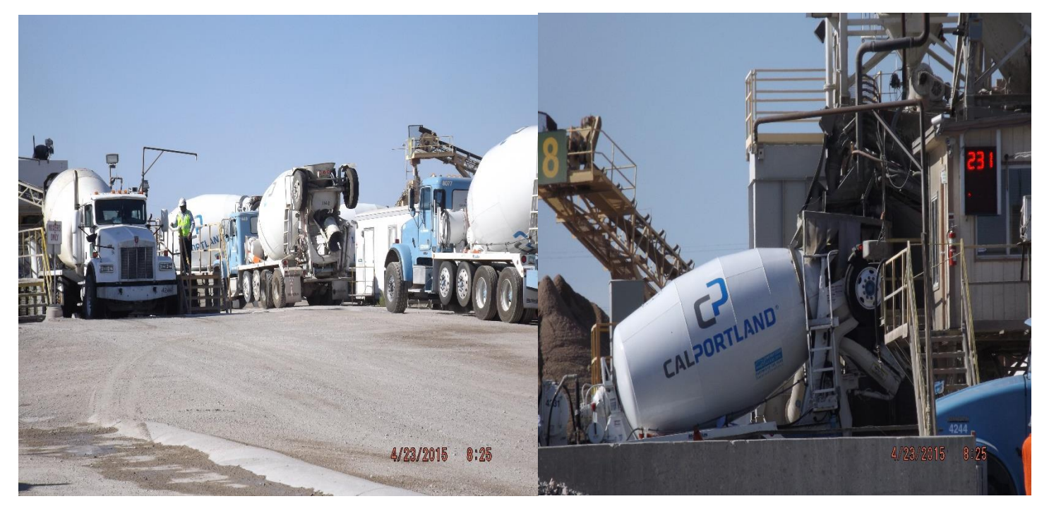
CPC Swan plant operations