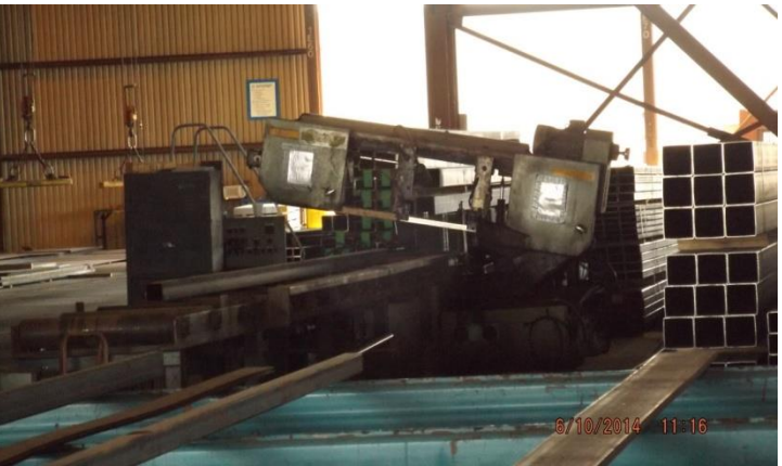
Steel cutting saw at Smith Pipe and Steel