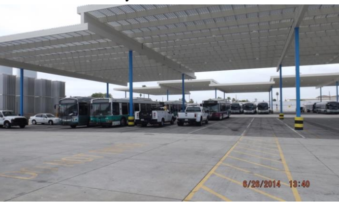
New canopy at the North Yard which was part of