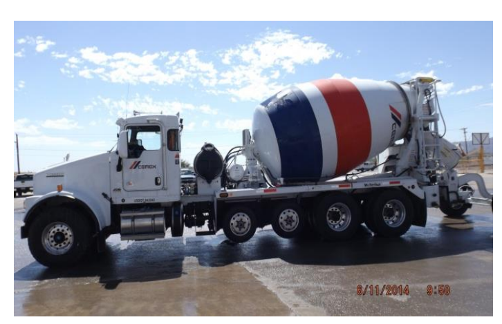
New 2015 mixer before silo collapse.