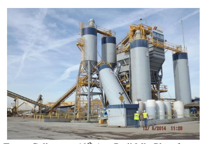
Tower Collapse at 19<sup>th</sup> Ave Redi Mix Plant for CEMEX. This occurred while a truck was being loaded