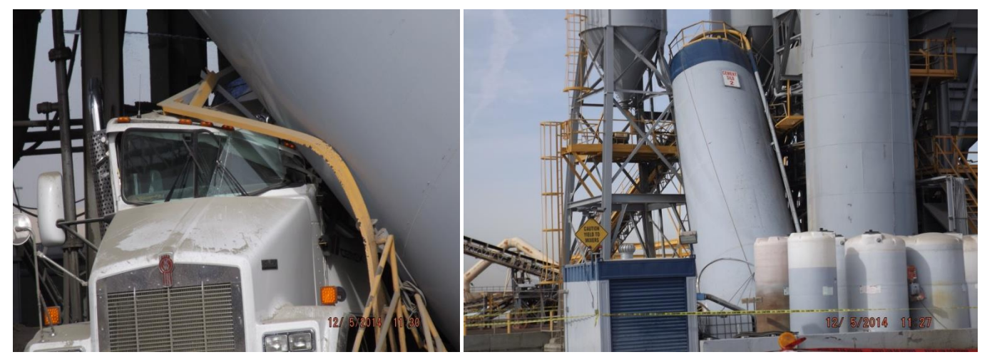
These kind of photos show why safety is a priority in the work place as well on the jobsite.