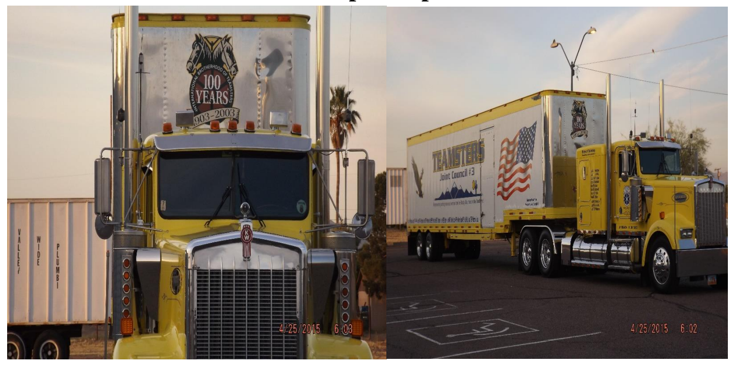
Joint Council 3 Truck