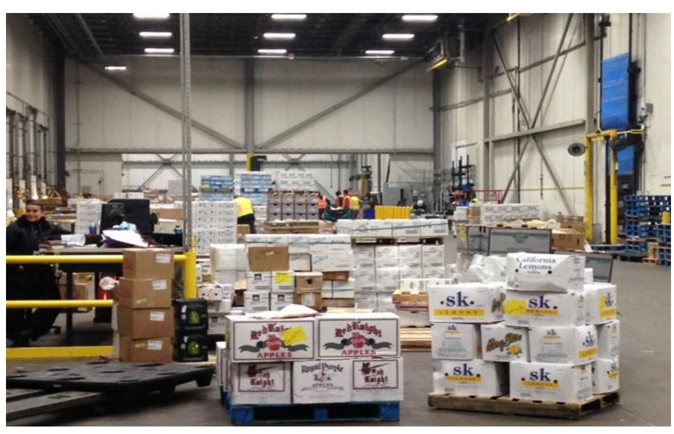
Sysco loading dock getting ready for trucks and our members taking care of business