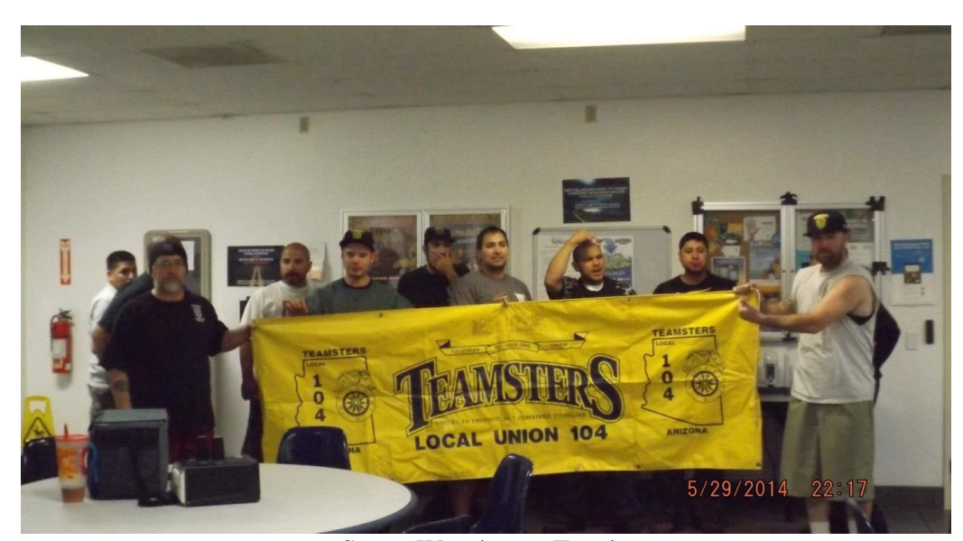
Sysco Warehouse Employees

As you may be aware SYSCO has not been successful in their attempt to merge with U.S Foods. We continue to stay informed and relaying any news to our members regarding any details regarding this issue.