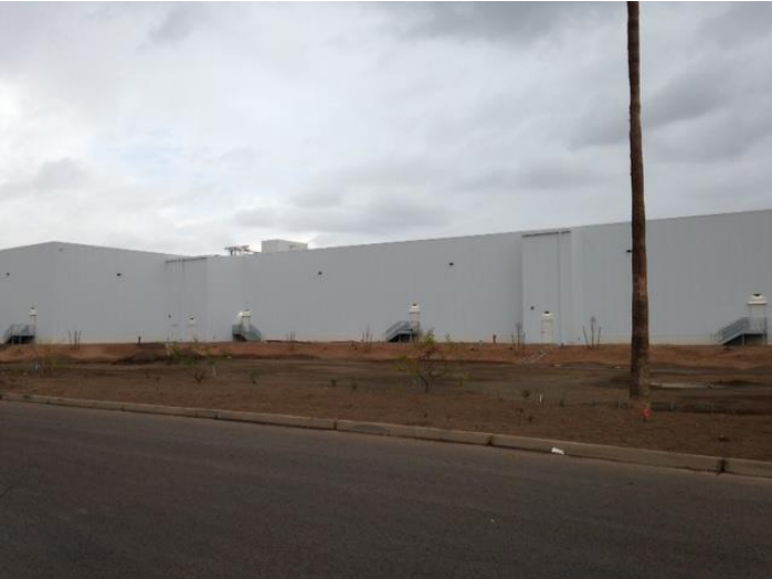
Expansion coming to completion and becoming operational

This expansion is due to the possible merger between Sysco and U.S. Foods. Currently the merger hasn't gone through and all are waiting on any updates. We will keep you posted as we get more reliable information. The following pictures show Freshpoint Produce Trucks that are now working out of the new expansion. This potentially will lead to 15-20 new members. The Union has been working with the company to get this off the ground and protect our members at the same time.