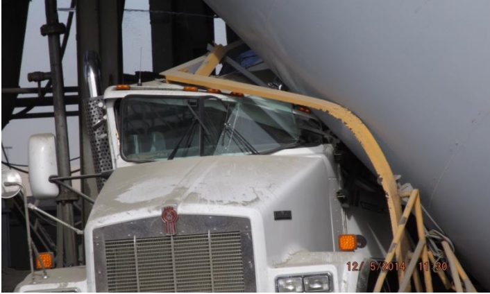
The Silo collapsed on the cab of the truck. This just shows how dangerous our jobs can be. Fortunately the driver wasn't hurt and will be able to return to work when he is released from the Doctor. Everyone has a part to play in safety. We all want to go home and see our families and loved ones at the end of the day. Stay aware and let your stewards or Business Agent know of any safety concerns you may have.