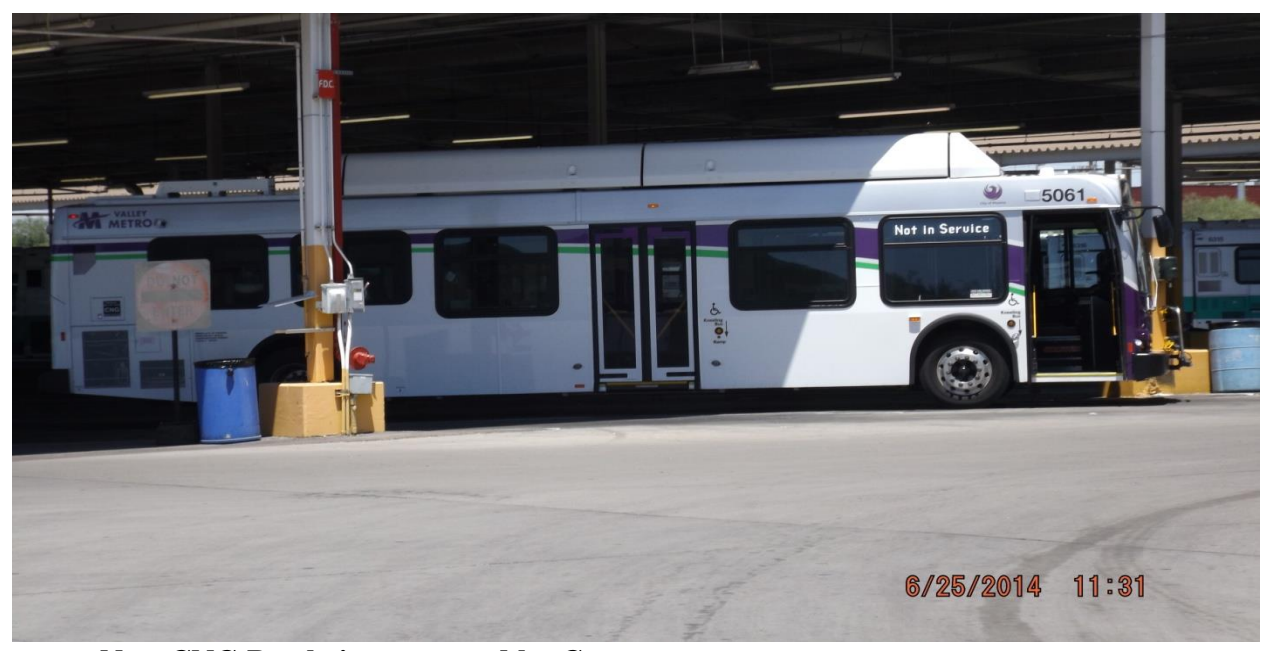
New CNG Bus being operated by Company

Veolia Transportation, which runs the North and South yards for the City of Phoenix received 60 new CNG New Flyer buses. These buses run exclusively out of the North facility which was recently renovated after a 14 month City of Phoenix project. The employees now have a newly renovated facility to work out of, which a great relief considering the age and the