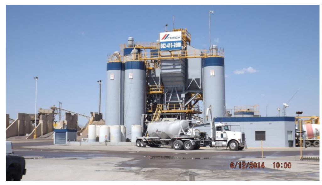
Before silo collapse