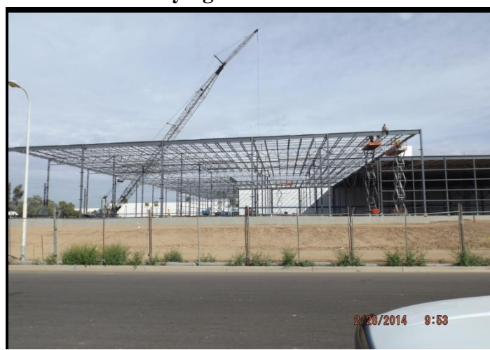
Expansion at SYSCO FOODS in the beginning