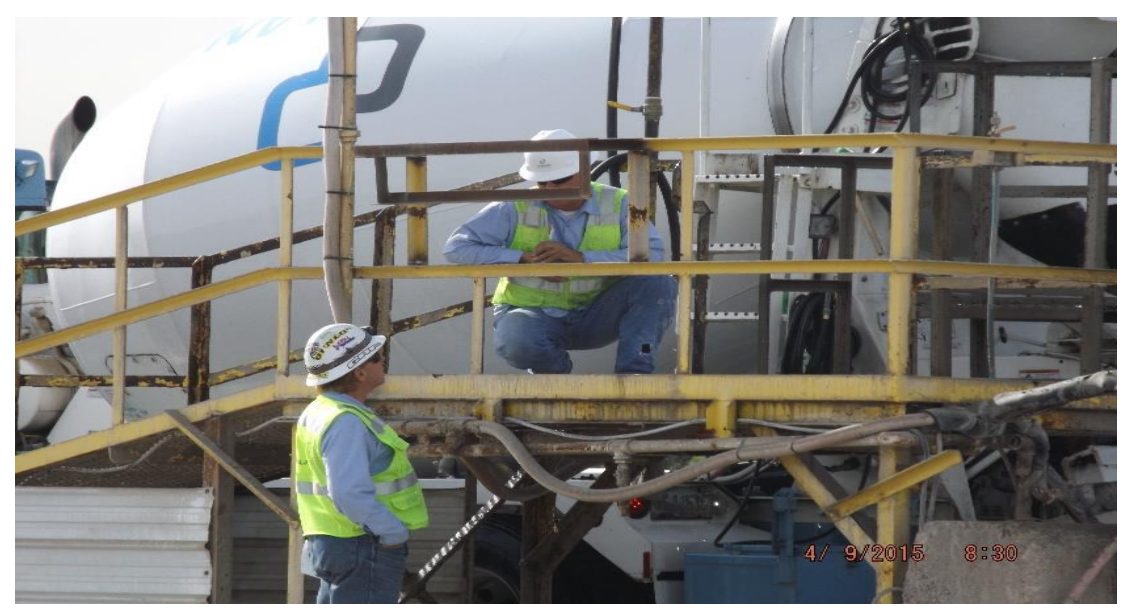
Checking the slump for a load and getting job info.