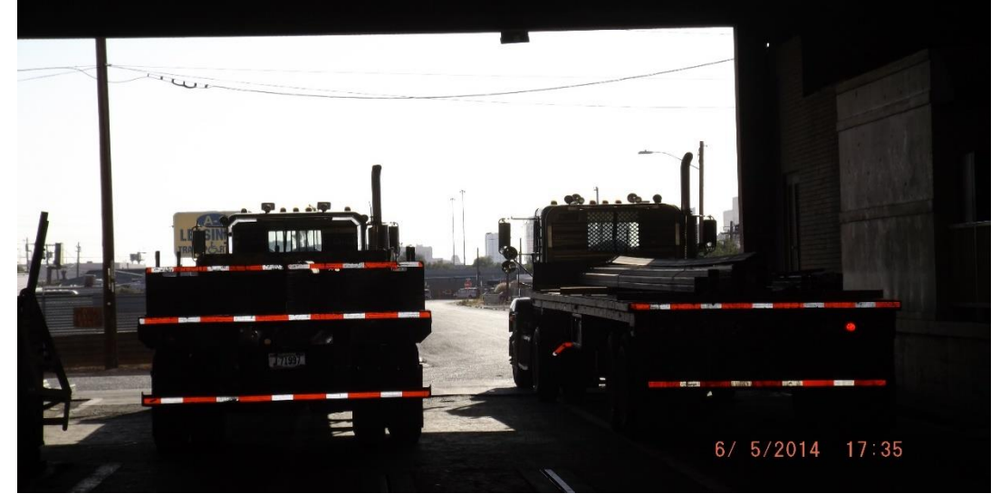
Trucks at Reliance getting ready to go on their deliveries