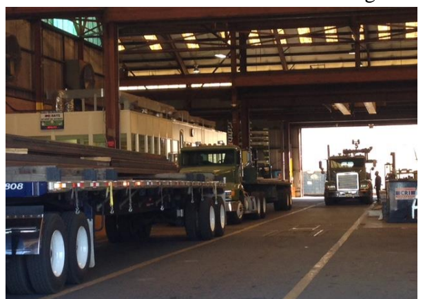
Truck in plant being loaded