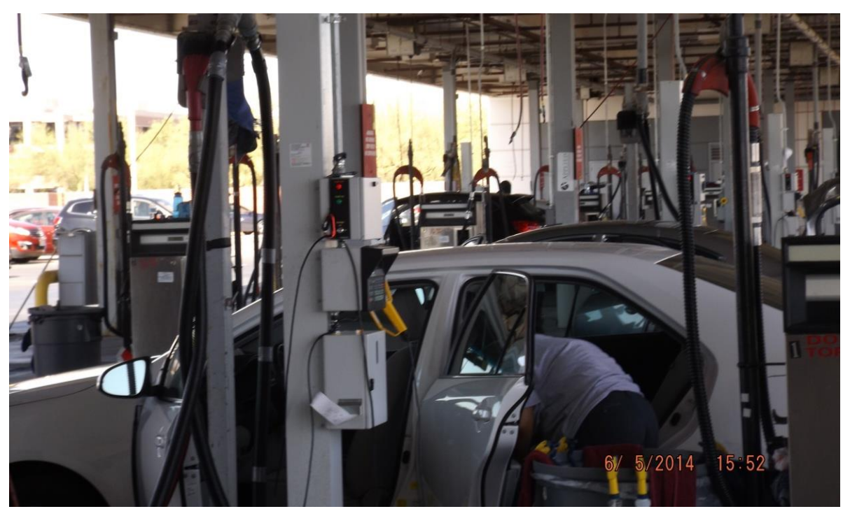
VSA'S doing their work on the line