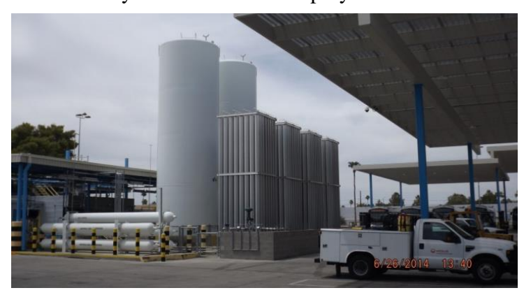
CNG tanks for new buses