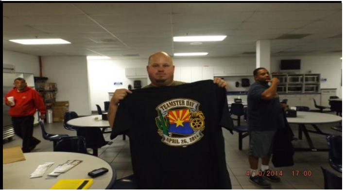
Sysco Warehouse Night time meeting after